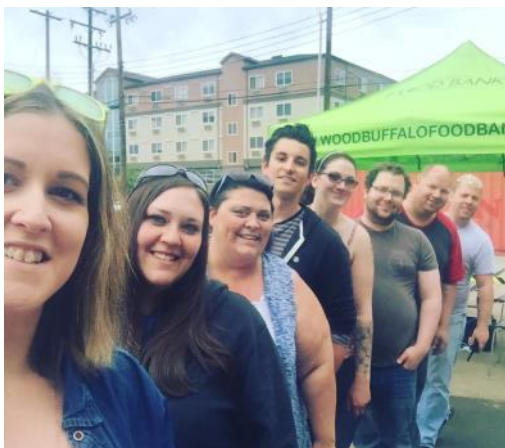
- Wood Buffalo Food Bank Staff & Board

We couldn't have accomplished all of this without our amazing volunteers who worked tirelessly beside us, or without the donors from across the country who reached out in sending food and monetary donations. There aren't enough words to express how truly grateful we are.