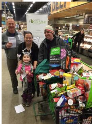
Leadership Wood Buffalo